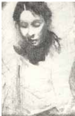
Penseroso , 15.9 x 9.8cm