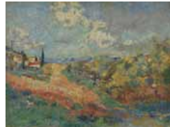
[Queensland Landscape] , c1932. Oil on board, 30.5 x 40cm