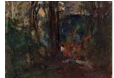
Bush Fire , c1936. Oil on board, 30.2 x 41cm