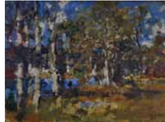
Narrabeen Lake , 1935. Oil on board, 30.7 x 41.5cm