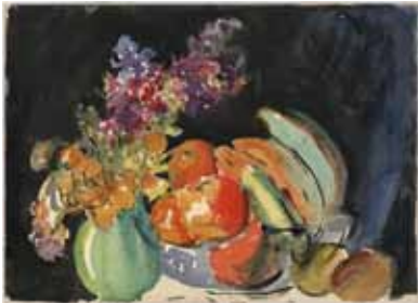
Fruit Study , 1932. Watercolour, 25.4 x 35.5cm

The forgotten Australian Impressionist is rediscovered in a new biography by Gael Hammer