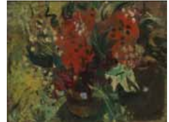
Gum Blossom and Wattle , c1934. Oil on board, 30.5 x 40.7cm